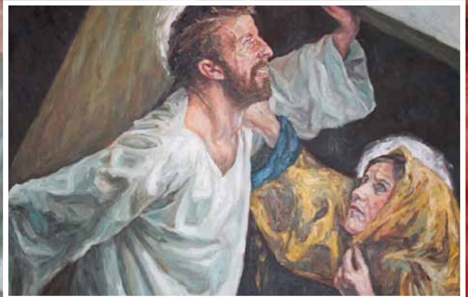
This exhibition is part of PassionArt 2014. See www.passionarttrail.co.uk for more.